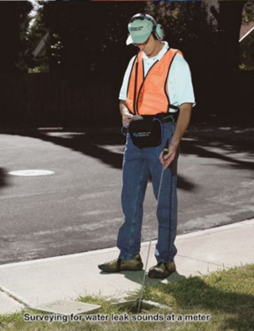
Surveying for water leak sounds at a meter