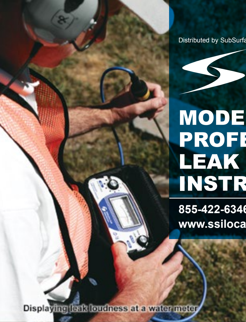
Displaying leak loudness at a water meter

855-422-6346 toll free www.ssilocators.com