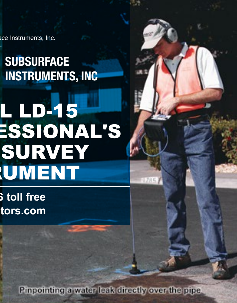
Pinpointing a water leak directly over the pipe