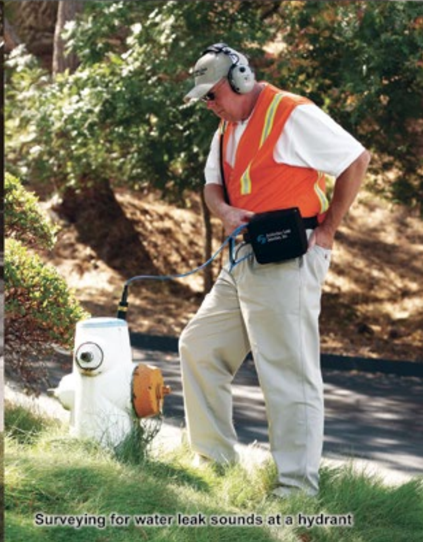
Surveying for water leak sounds at a hydrant